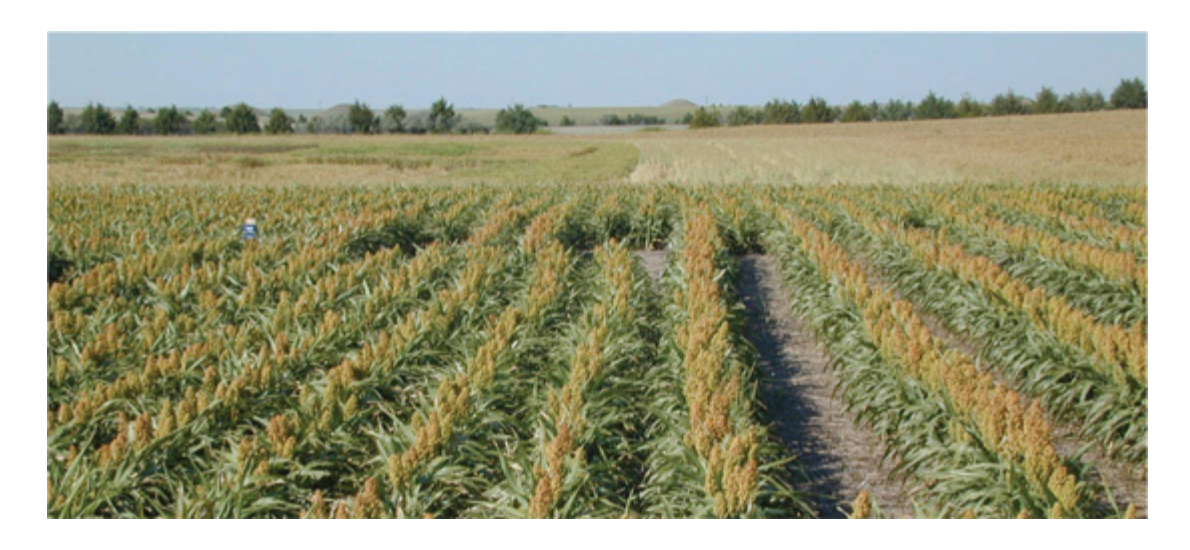
Conventional planting on the left, compared with plant1 – skip1 on the right

d) Triangular method of planting - It is recommended for wide spaced crops like coconut,